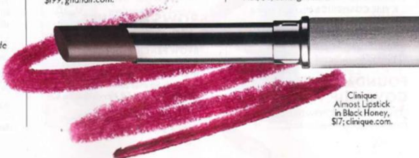
Clinique Almost Lipstick in Black Honey, $17; clinique.com .